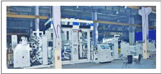
Extrusion Coating Lamination