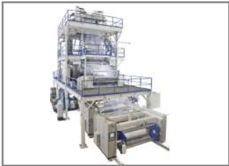
Multilayer Blown Film