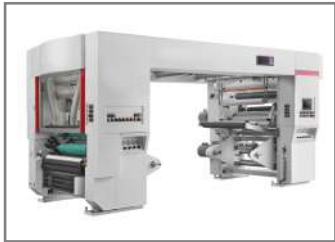
Solvent Based Lamination