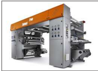
Solvent Less Lamination